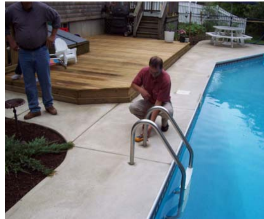
Figure #2 – Stray Voltage Measurement at Pool

Practically speaking, the argument could be made that workman wearing shoes and possibly gloves, could withstand much higher stray voltage values without lethal consequences. For example, OSHA Standard 1910.333 “Electrical Safety Related Work Practices: Selection and Use of Work Practices, uses a limit of 50 volts for working on energized equipment.