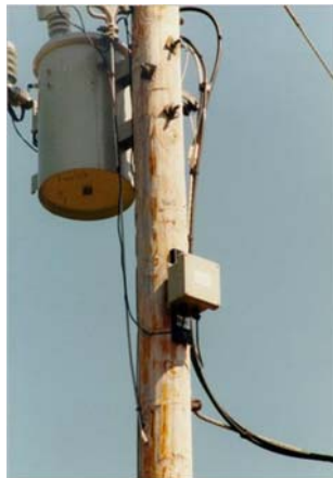
Figure # 5 – Neutral Isolator Installation