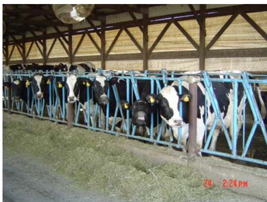
Figure #3 – Happy Cows Feeding

It should be noted that the limits shown above do not satisfy Ohm's Law and are not meant to. For example, by using the minimum resistance and minimum currents some suggest a stray voltage limit of 0.16 volts , which is extremely low. The Public Service Commission of Wisconsin, known in the industry for their stringent requirements in this area, considers a 1 volt limit very conservative. This, quite frankly, is the dilemma which separates the dairy farmer and the utility from agreeing on one acceptable limit.