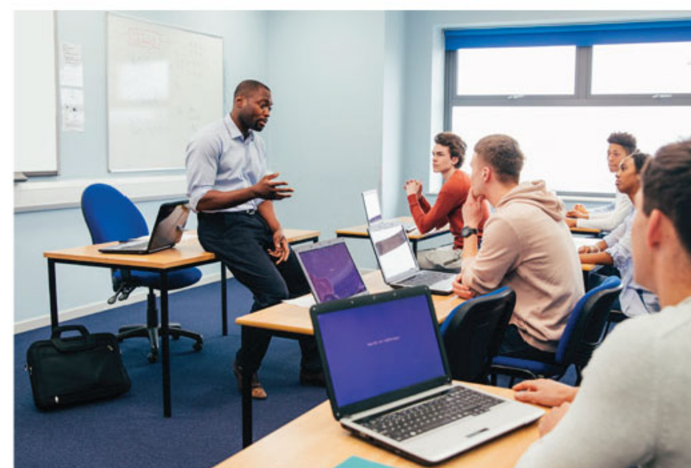
LIVE INSTRUCTOR-LED CLASSES