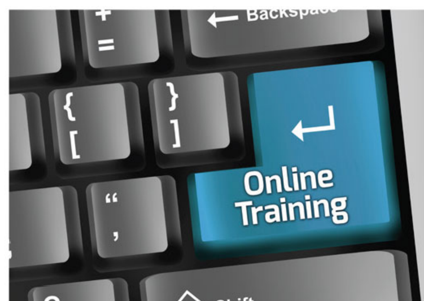
INSTRUCTOR-COORDINATED STUDENT-DIRECTED DIGITAL LEARNING