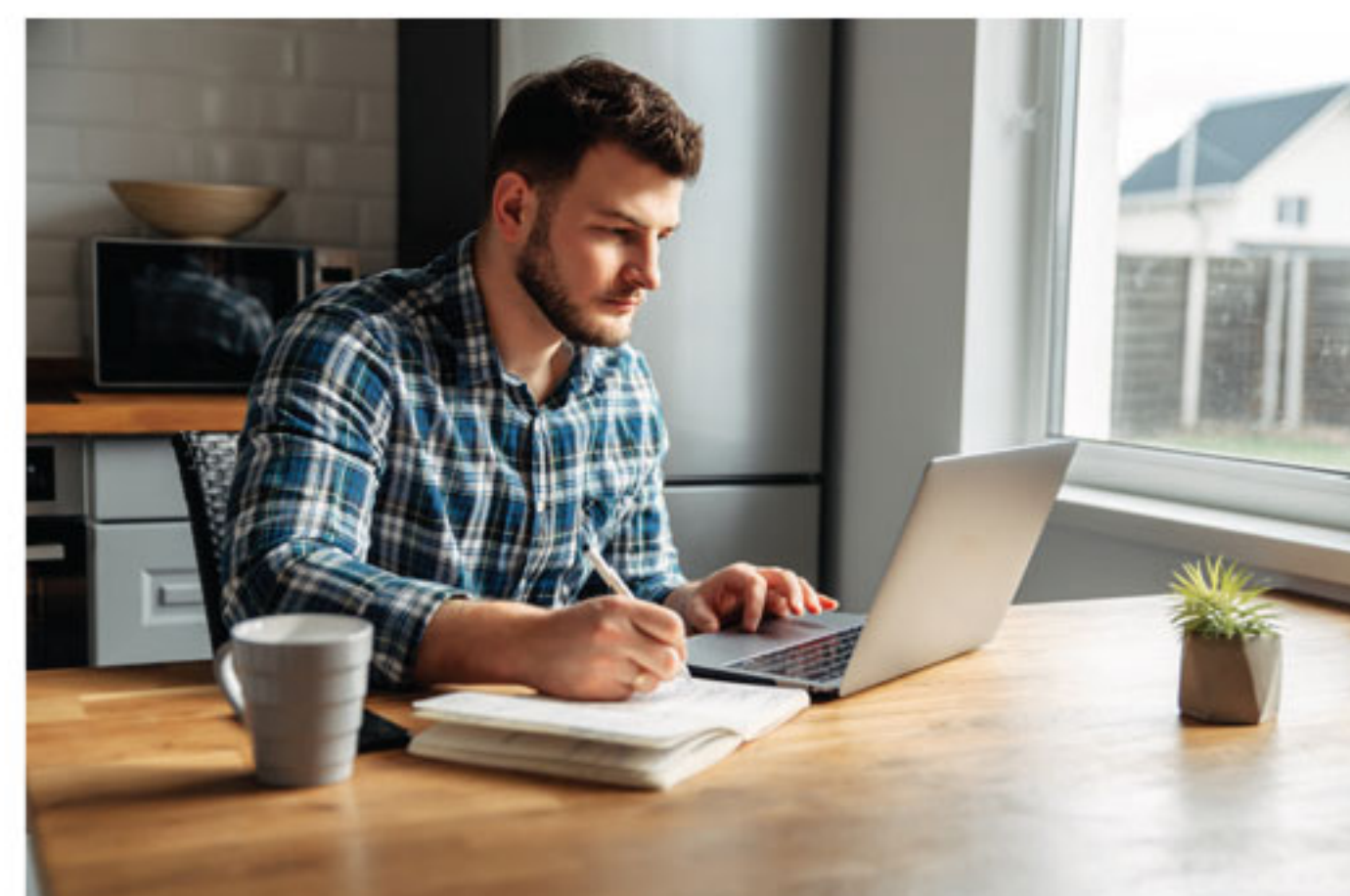
VIRTUAL ONLINE INSTRUCTOR-LED CLASSES