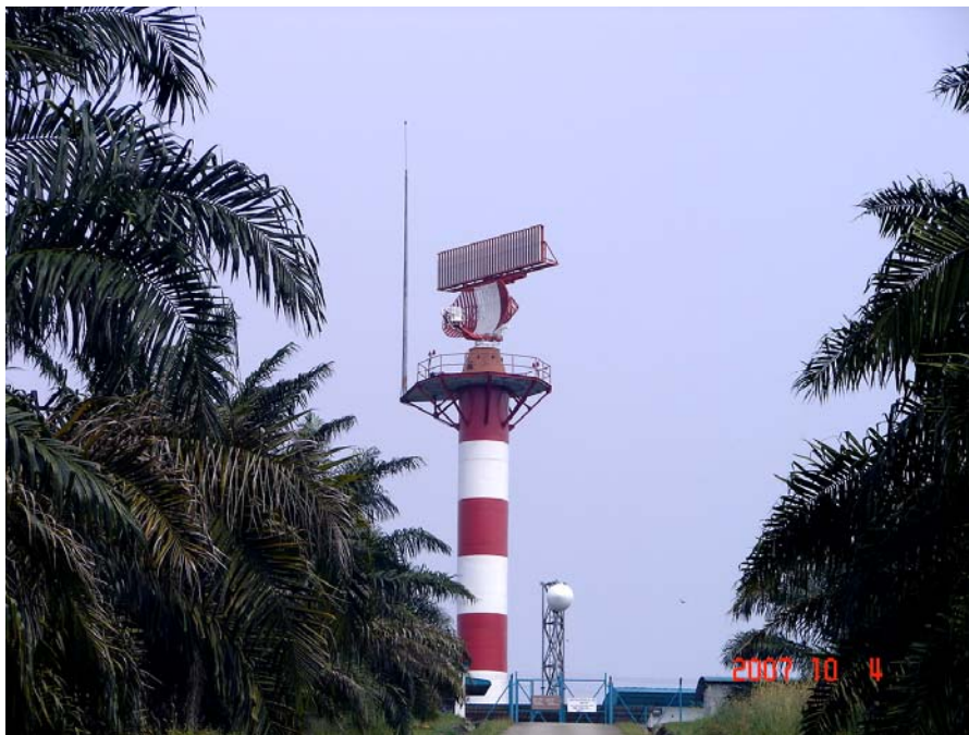
Top picture: The KLIA radar station in 2002 with the Dynasphere air terminal. Bottom picture: The same station in 2007 with the EF air terminal.