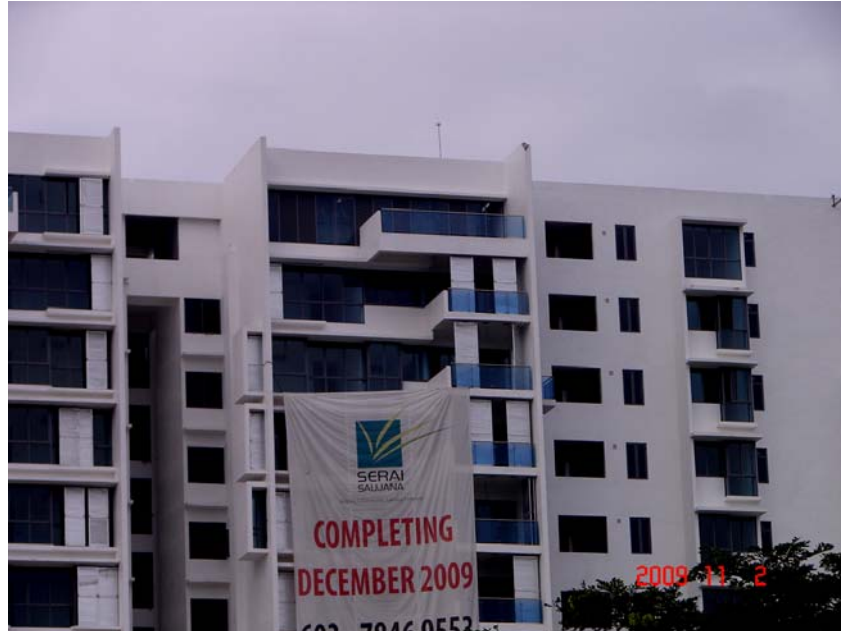
Above: The Serai Saujana Condominium which was installed with the PDC air terminal. Below: A close-up view of the PDC air terminal and the nearby damage caused by lightning.

Some of the new uncompleted buildings have even been struck and damaged by lightning within a year of the ESE air terminal installation, with the damage located well within the claimed protection zone of the air terminal as the example below shows.