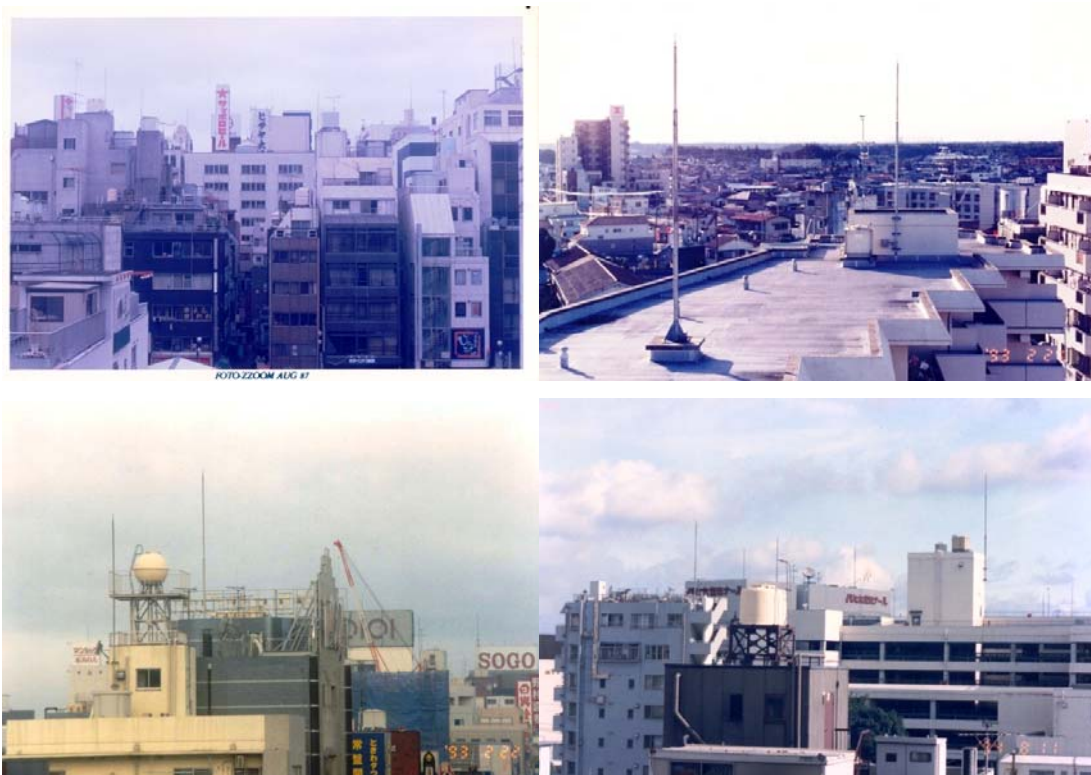
Above: These photographs show pole-mounted Franklin rods which complied with the Japanese standard. The very first photograph (top left) in the study was taken in Tokyo in August 1987.

We have also made similar studies of buildings in London and a few other cities in the UK and have found that the use of the ESE air terminals there is less than 50%. In addition, the feedback we received from lightning experts in some Latin American countries mentioned in the advertorial revealed that ESE air terminals made up less than 50% of the installed LPS in those countries.