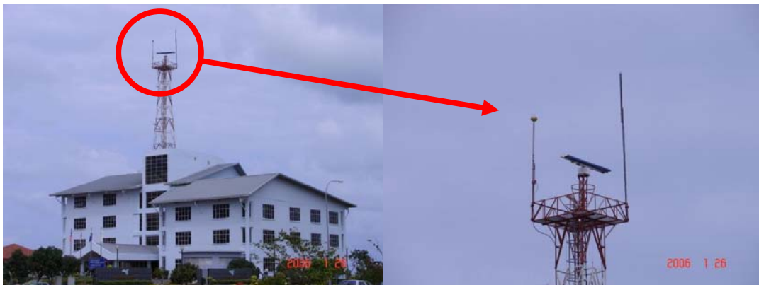
Above: A Dynasphere and an EF air terminal at a radar facility in Kertih, Terengganu.

Some of the failures of the ESE air terminals can be inferred when two of these terminals were used at the same site. In some cases, they were installed right next to each other. However, the non-expert may not realize this even though he can see them.